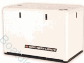
Sound Enclosure Dimensions - Length x Width x Height: 43.6 in x 27.3 in x 27.4 in (1107 mm x 693 mm x 697 mm)